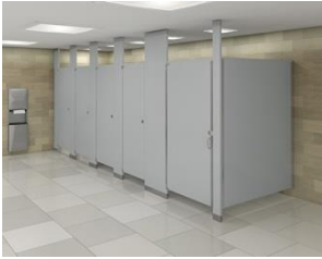
10 21 13.15 Stainless Steel