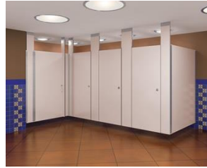
10 21 13.19 Solid Plastic