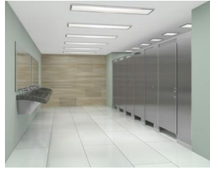
10 21 13.17 Solid Phenolic