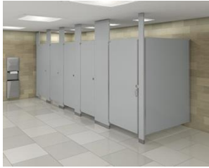
10 21 13.15 Stainless Steel