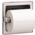
10 28 13.13 Commercial Toilet Accessories