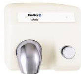
10 28 13.19 Healthcare Toilet Accessories