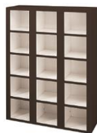
10 51 26.13 Recycled Plastic Lockers